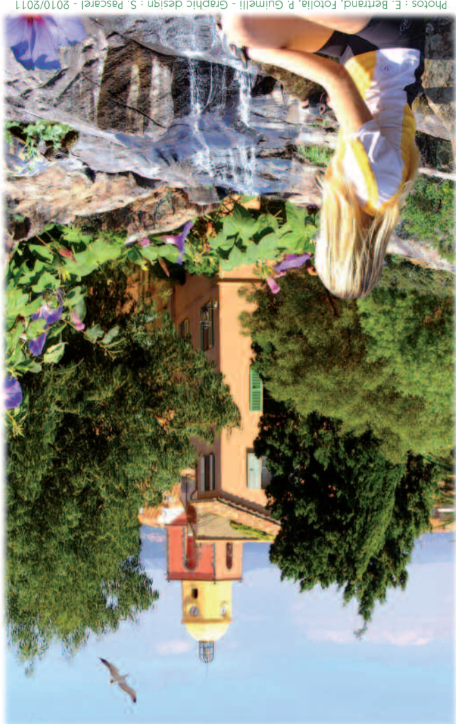
Happiness to share